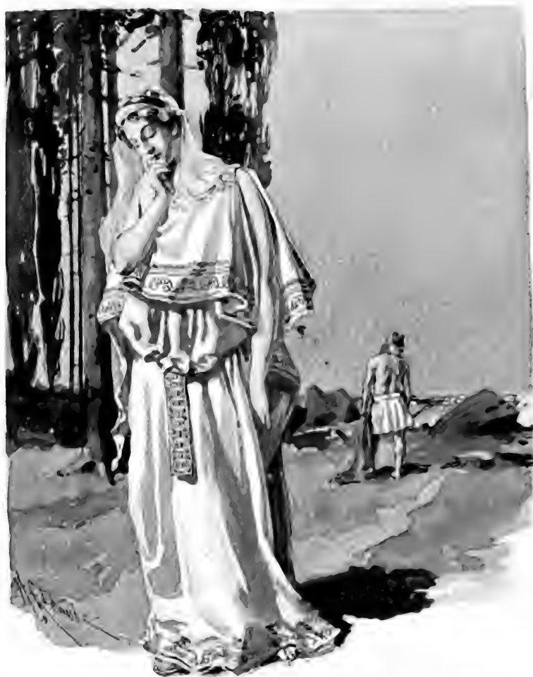
"CALYPSO, GORION'S GODDESS, SOUGHT HER HOME.—Page 281